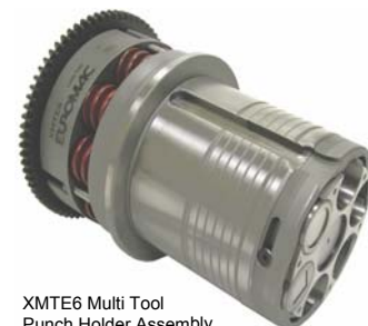
XMTE6 Multi Tool Punch Holder Assembly available exclusively from Euromac